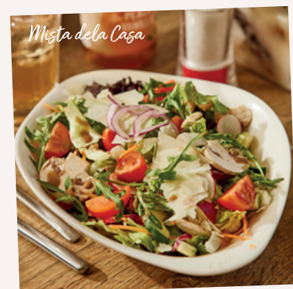
Mista della Casa