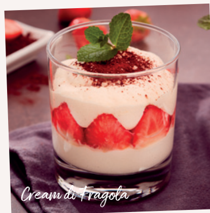
Cream di Fragola

Vapiano Seasonal Dessert 24.90 Ask our Vapianisti.